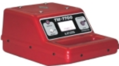
The TW-7700 Transmitter.

WARNING: Do not handle output leads unless power is off. ELECTRIC SHOCK HAZARD: Servicing to be performed by qualified personnel only.