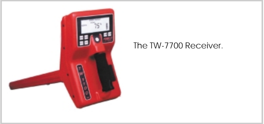
The TW-7700 Receiver.