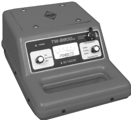
The TW-8800 Transmitter.

WARNING: Do not handle output leads unless power is off. ELECTRIC SHOCK HAZARD: Servicing to be performed by qualified personnel only.