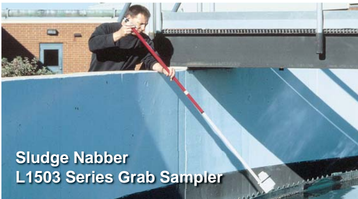
Sludge Nabber L1503 Series Grab Sampler

With no membranes or fill solution to change, you will spend fewer hours maintaining and calibrating your dissolved oxygen probe.