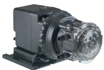
STENNER PUMPS CLASSIC SERIES S85MJH1A1STAA See page 5